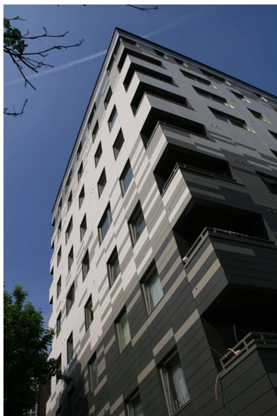
CABE 2009 Building for Life Gold Standard

The assessors' view was that Stadthaus is an outstanding scheme. It delivers an innovative building while still integrating successfully with its context and delivering a high quality public realm.