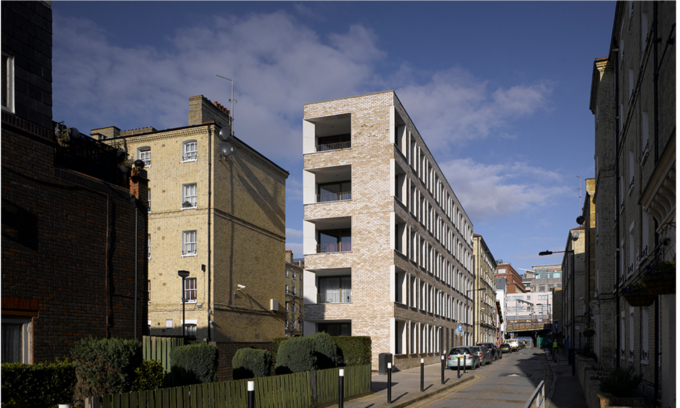
Peabody Whitechapel Estate