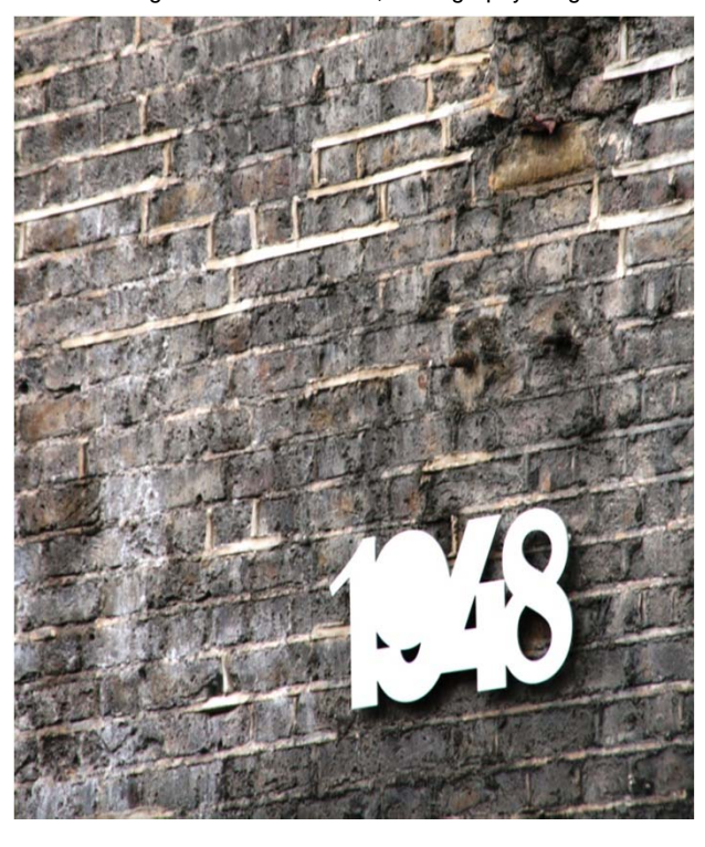
Designer: Wilson Brothers

The case was made that this would take a low grade site, employing a single person, and bring to the area a new and interesting retail concept, employing many more people. CMA Planning secured permission to extend the use in May 2011.