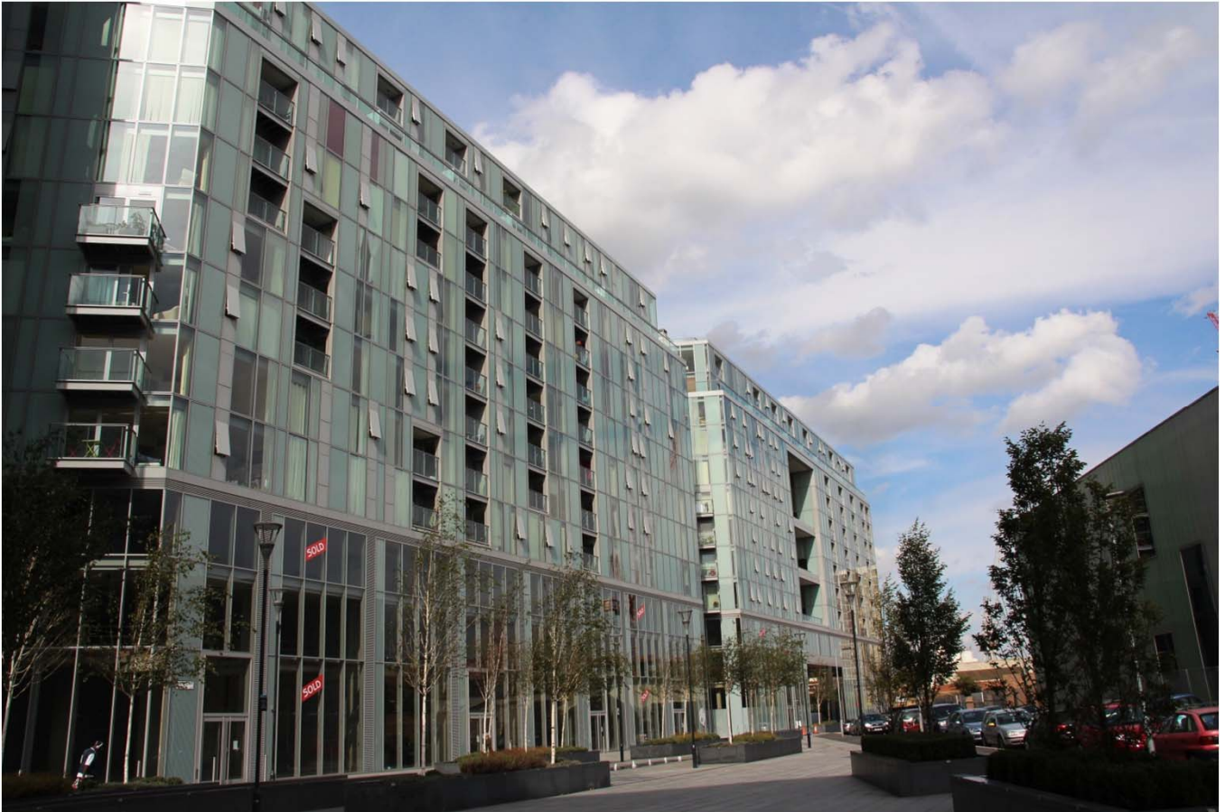
Architect: Squire & Partners