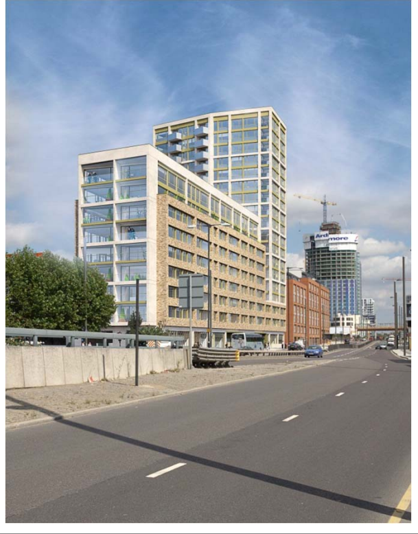
CMA Planning 113 The Timberyard, Drysdale Street, London, N1 6ND www.CMA-Planning.co.uk

CMA Planning advised on the approach and planning strategy from conception and throughout the process, project managing the application process and securing approval from the Olympic Delivery Authority (now the LLDC) in March 2012.